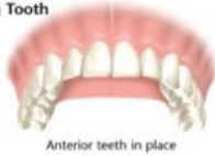
Anterior teeth in place