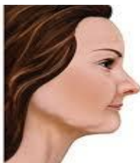
after tooth loss