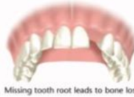
Missing tooth root leads to bone loss