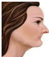
after bone loss